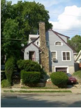
6th Street Viaduct follow to Elberon at top on Right

Unit# Subu Price Hill LP$ 69,000 State OH Zip 45205